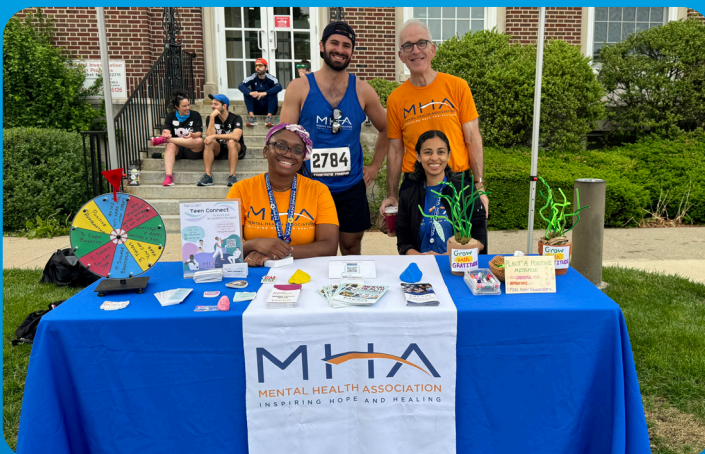
The Mental Health Association cheering on runners at the 41st Annual Montclair Run.