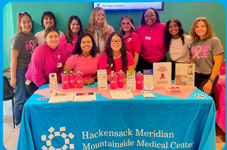
Mountainside Medical Center educating members at our Park Street Y during Breast Cancer Awareness month.